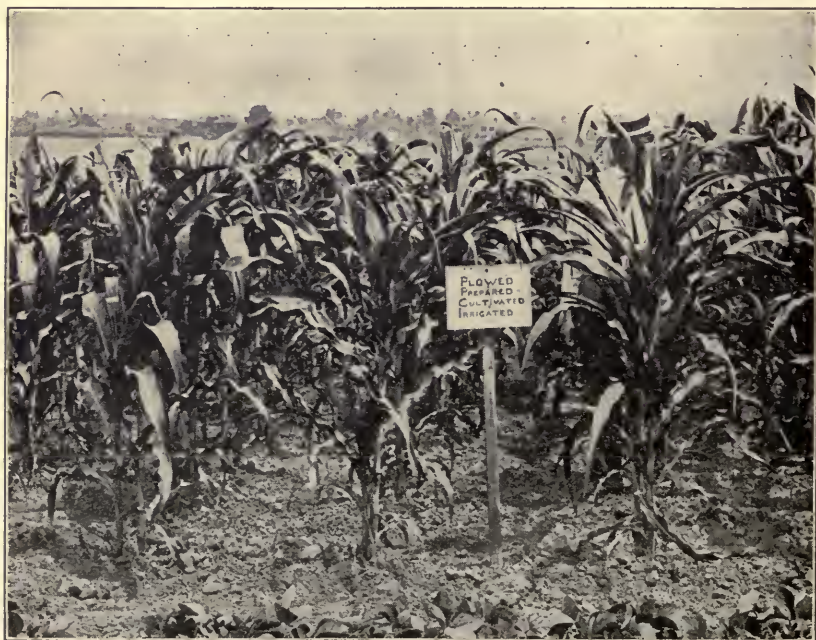
FIG. 5.—PLOT 5: GROUND PLOWED AND SEED BED PREPARED, CULTIVATED THREE TIMES, IRRIGATED (16.91 INCHES APPLIED). YIELD, 55 BUSHELS (1911)

The fertilized plot, No. 6, gave a large increase, the average yield being 74.5 percent above that from standard cultivation. For two years, 1908 and 1909, this plot was not fertilized; hence the yields for these years have been omitted in the table. In 1914, because of the heavy growth, the crop was badly damaged by a storm. The average yield for the seven years was 75.3 bushels per acre, or 174.5 percent of the yield from the standard cultivated plot for the same years.