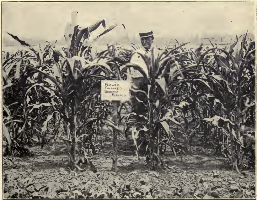
FIG. 2.—PLOT 2: GROUND PLOWED, SEED BED PREPARED, WEEDS KEPT DOWN BY SCRAPPING WITH A HOE. YIELD, 39.8 BUSHELS (1911)

Plot 4 was treated like Plot 2, except that the corn was cultivated shallow three times with the three-shovel cultiva-