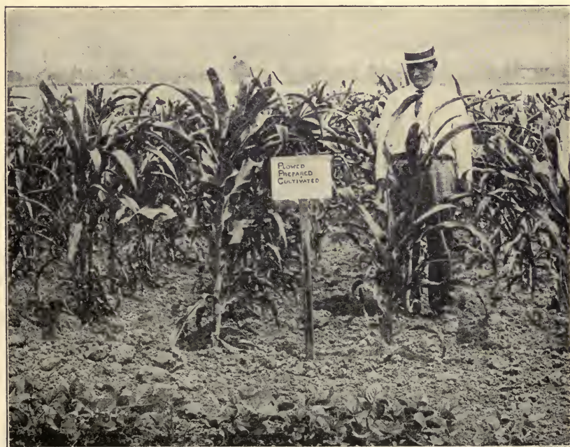
FIG. 4.—PLOT 4: GROUND PLOWED, SEED BED PREPARED, CULTIVATED THREE TIMES. YIELD, 34.5 BUSHELS (1911)

In order to determine whether it was a lack of moisture that produced the low yields where weeds and corn were grown together, Plot 3 was divided in 1911, and the north half was irrigated often enough to keep the soil abundantly supplied with moisture. The effect was quite noticeable both on the corn and the weeds, but as an average of four years the yield was increased only 3.8 bushels per acre. It must therefore appear that the injury done by weeds is not largely due to the moisture that they take out of the soil, but to some other cause or causes.