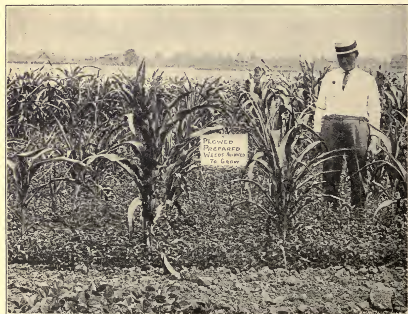
FIG. 3.—PLOT 3: GROUND PLOWED, SEED BED PREPARED, WEEDS ALLOWED TO GROW. YIELD, .8 BUSHEL (1911)

In Table 6, the yield of the cultivated plot, No. 4, is taken as the standard for computing the relative yields shown in the last column. On Plot 1, without plowing or the preparation of a seed bed in any way, the average yield for eight years was 31.4 bushels per acre, or 80.1 percent of that of the standard cultivated plot, No. 4. In comparison with this, on Plot 2, where a good seed bed had been prepared and the weeds kept down, the percentage of yield was 117.1, while the average actual yield for the eight years was 45.9 bushels, or an increase of 14.5 bushels per acre over Plot 1. This represents the value of the seed bed. The lowest yield of Plot 2 was 33 bushels in 1908 and the highest, 75.5 bushels in 1912. It would seem scarcely possible that such a yield as this could be produced without cultiva-