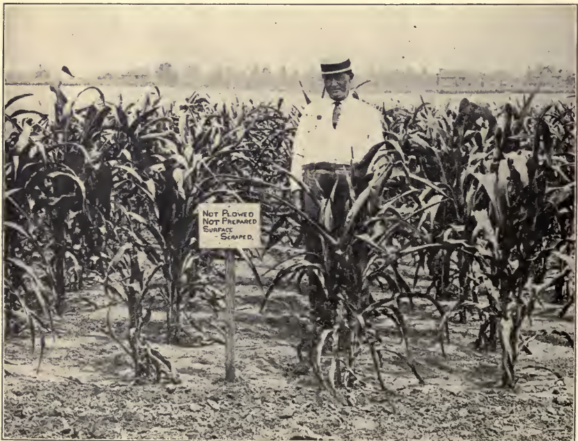
FIG. 1.—PLOT 1: GROUND NOT PLOWED, NO SEED BED PREPARED, WEEDS KEPT DOWN BY SCRAPING WITH A HOE. YIELD, 25.5 BUSHELS (1911)

It will be seen that the largest amount of water, 16.91 inches, was applied during 1911, and the next largest, 12.85 inches, in 1913. The water was applied in amounts equal to about an inch of rainfall, by the furrow method of irrigation. After it was absorbed and the soil had become sufficiently dry, the furrows were partly filled with loose soil to prevent any excessive loss by evaporation. The yields for 1913 were diminished by the extreme heat during the time when pollination was taking place. A storm on July 16, 1914, damaged the corn on all plots to some extent, but especially where the growth was rank, as on the fertilized and irrigated plots.