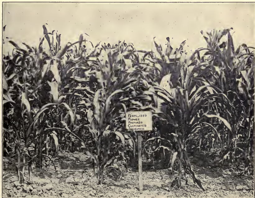
FIG. 6.—PLOT 6: GROUND PLOWED, SEED BED PREPARED, CULTIVATED THREE TIMES, IRRIGATED (16.91 INCHES APPLIED), HEAVILY FERTILIZED. YIELD, 77.3 BUSHELS (1911)

A study of the moisture content of the plots at Urbana was made from samples taken to a depth of 40 inches from four different plots. The samples were taken in the spring immediately after the plowing was done and once each week until the corn was mature. Table 9 gives the results in percentage of total moisture.