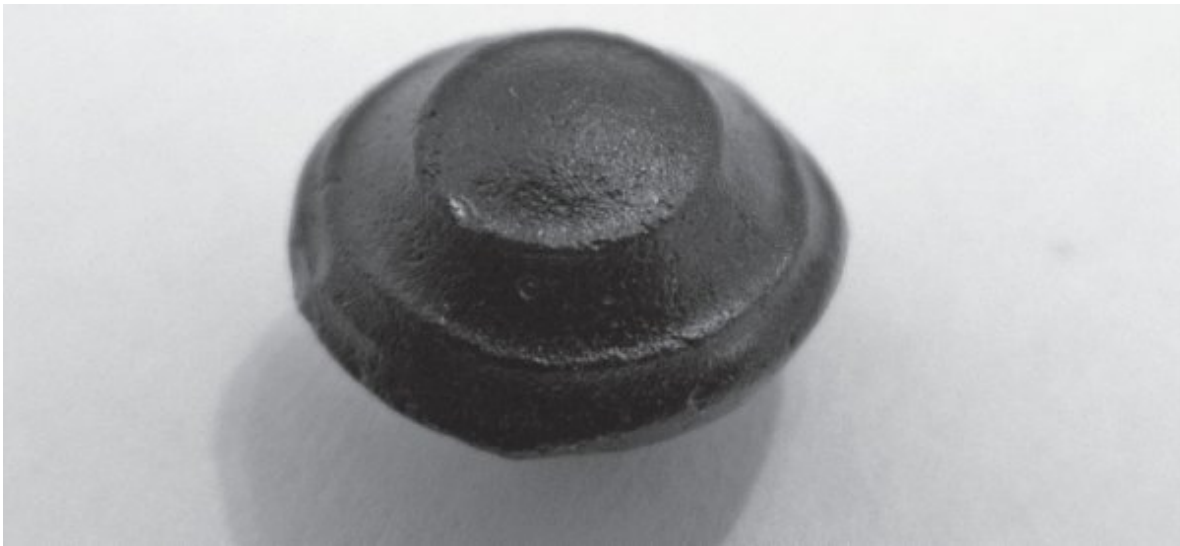
Australite sample two

The fragments apparently entered at very high speed with flight conditions leading to deceleration body force one or two orders of magnitude higher than the earth's gravitational force at the time of impact. Though scientists freely admit that nobody knows precisely what the source body was, they do openly acknowledge that it did not have the chemistry of any typical meteorite.