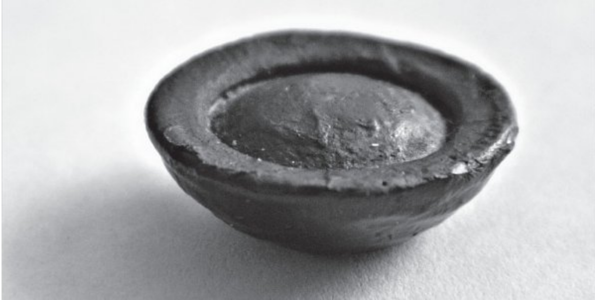
Australite sample one