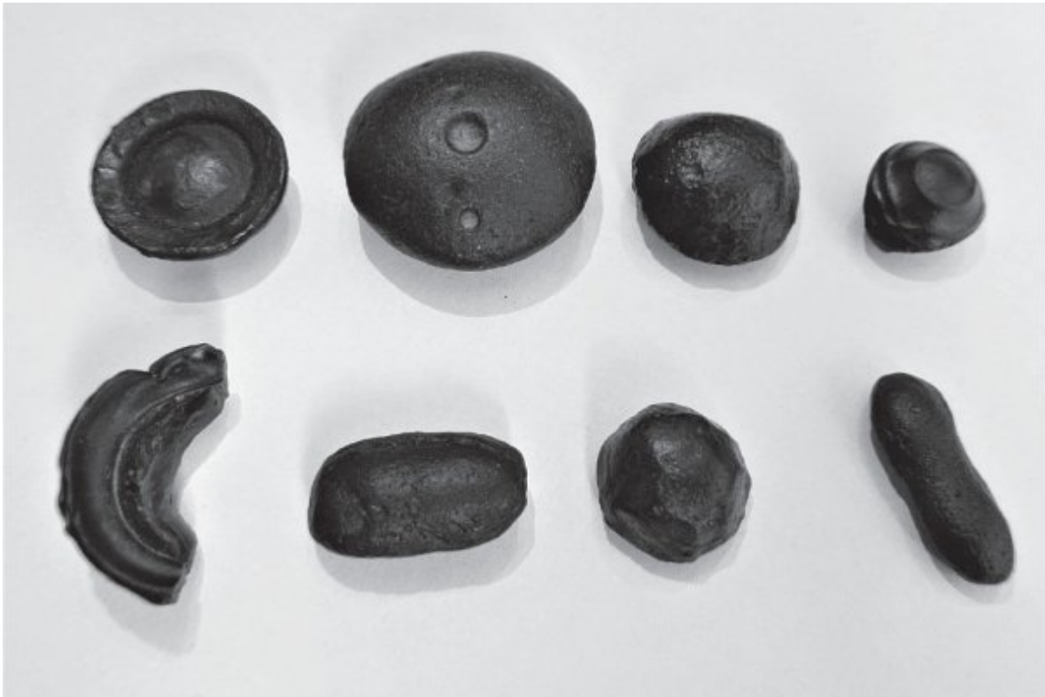
Examples of australites, also known as tektites

or re-entered the atmosphere as cold solid bodies; in case of average-size specimens, the entry direction was nearly horizontal and the entry speed between 6.5 and 11.2 km/sec. Terrestrial origin of such spheres is impossible because of extremely high deceleration rates at low altitudes. 10