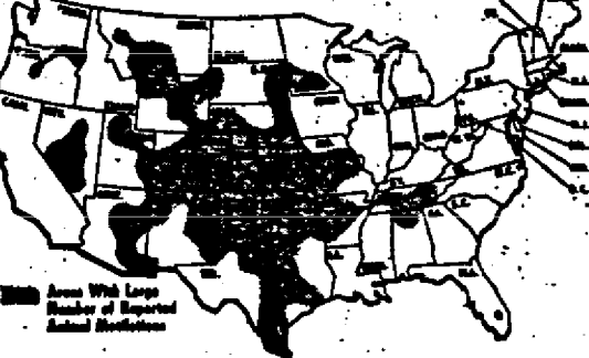
BAFFLING incidents have occurred in 18 states.

trooper who has investigated more than 30 attacks.