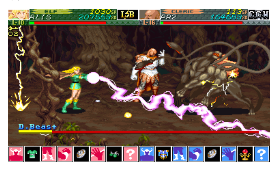
Figure 2: SoMScreenshot

and we played a Dungeons and Dragons game in MAME. I hear that it's also available on Steam. The game is Dungeons and Dragons: Shadow over Mystara. There's also the Tower of Doom. They were both developed by Capcom, who as most people know, also developed games like Mega Man, Street Fighter and so forth.