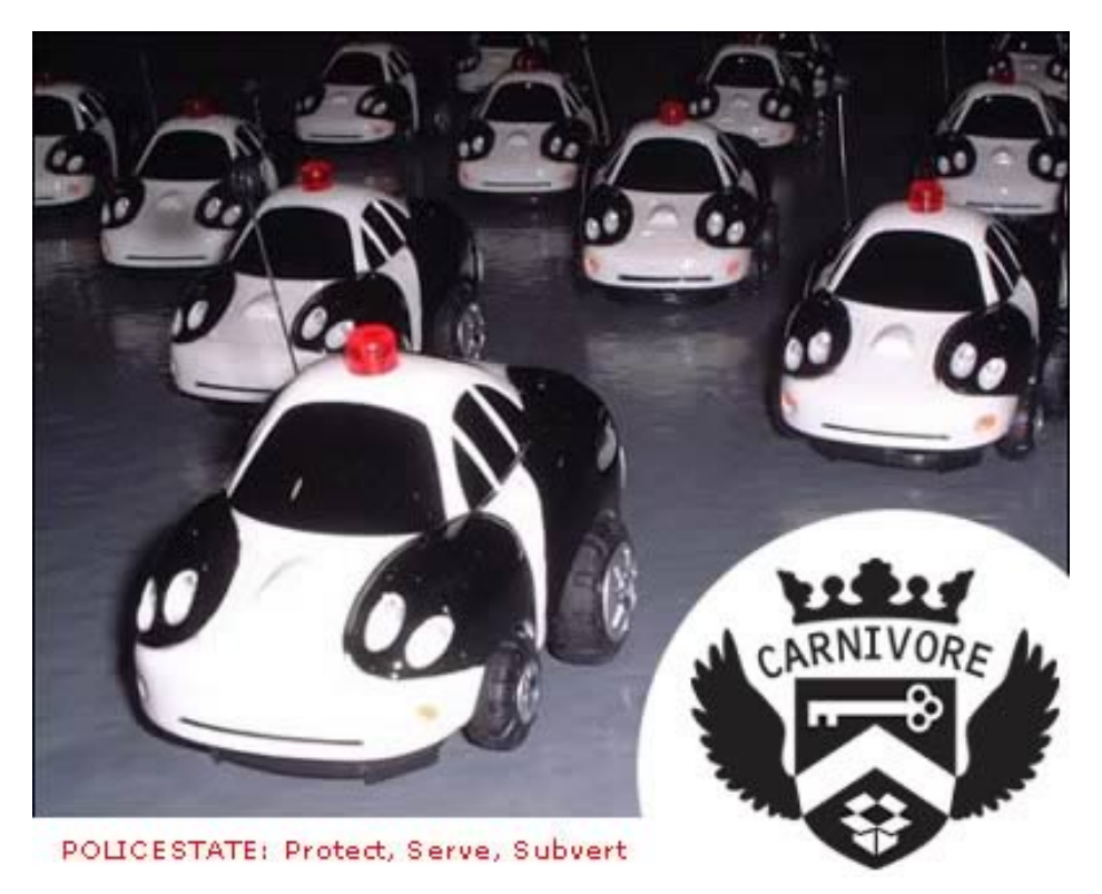
Figure 5: Brucker-Cohen, POLICESTATE (2003)

This might seem just a quantitative change in terms of information processed, but what really happens in this case is that the power of the apparatus increases qualitatively : from a situation where, in obtaining private data about a specific citizen, is necessary a legal mandate issued by a judge (or by extraordinary anti-terrorism regulations), to a situation where the whole data about every citizen moving with public transport across a city is automatically examined by national law enforcement apparata. Such a large pool of generic information is not only available for immediate consultation when needed, but constitutes a flow of real life samples which can be constantly analysed in search for deviance patterns and relationships to suspicious individuals.