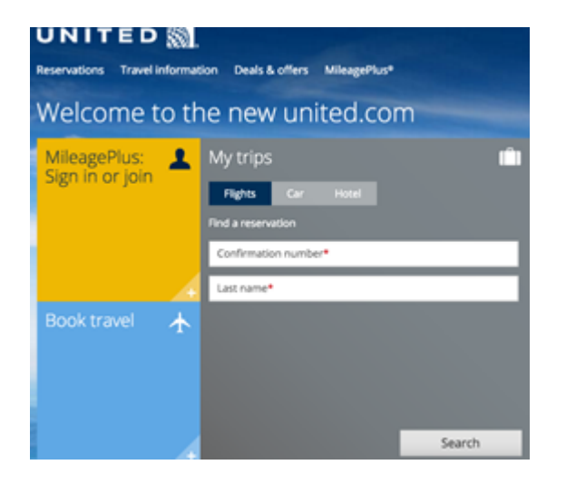
Figure 6 - United Airlines

The experts noticed many similarities with American Airlines and United Airlines, although United only requires users to know the confirmation number and traveler's last name, both information present of a boarding pass.