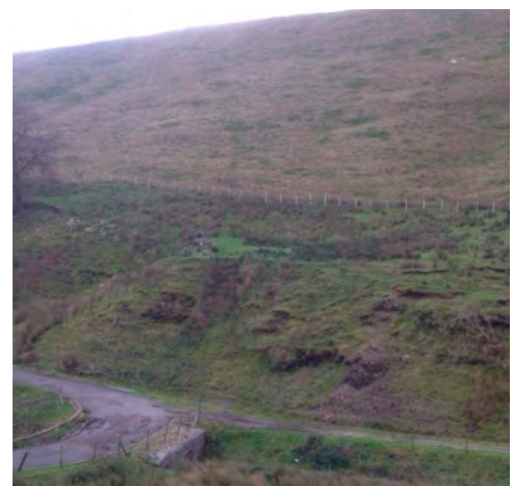
Our Site at Gorpley

The image above does not really do justice to the size of this year's tree-planting site on Yorkshire Water land at Gorpley (above the Coal Authority Water treatment plant at Clough Foot), and it is just one of the sites we will be planting this season. (The others are Cragg Vale Country Business Park, Popples End, Lower Blackshaw Farm, Crow Hill Shaw Farm, Rock Nook, Roebucks, West Gable, Tinker Bank, Middle Small Shaw Farm, Old Ridings and Horsehold Road). Taken all together this means that we will be planting in the region of 25,000 trees – more than double our tally for last year, and more than we have ever planted in one season before.