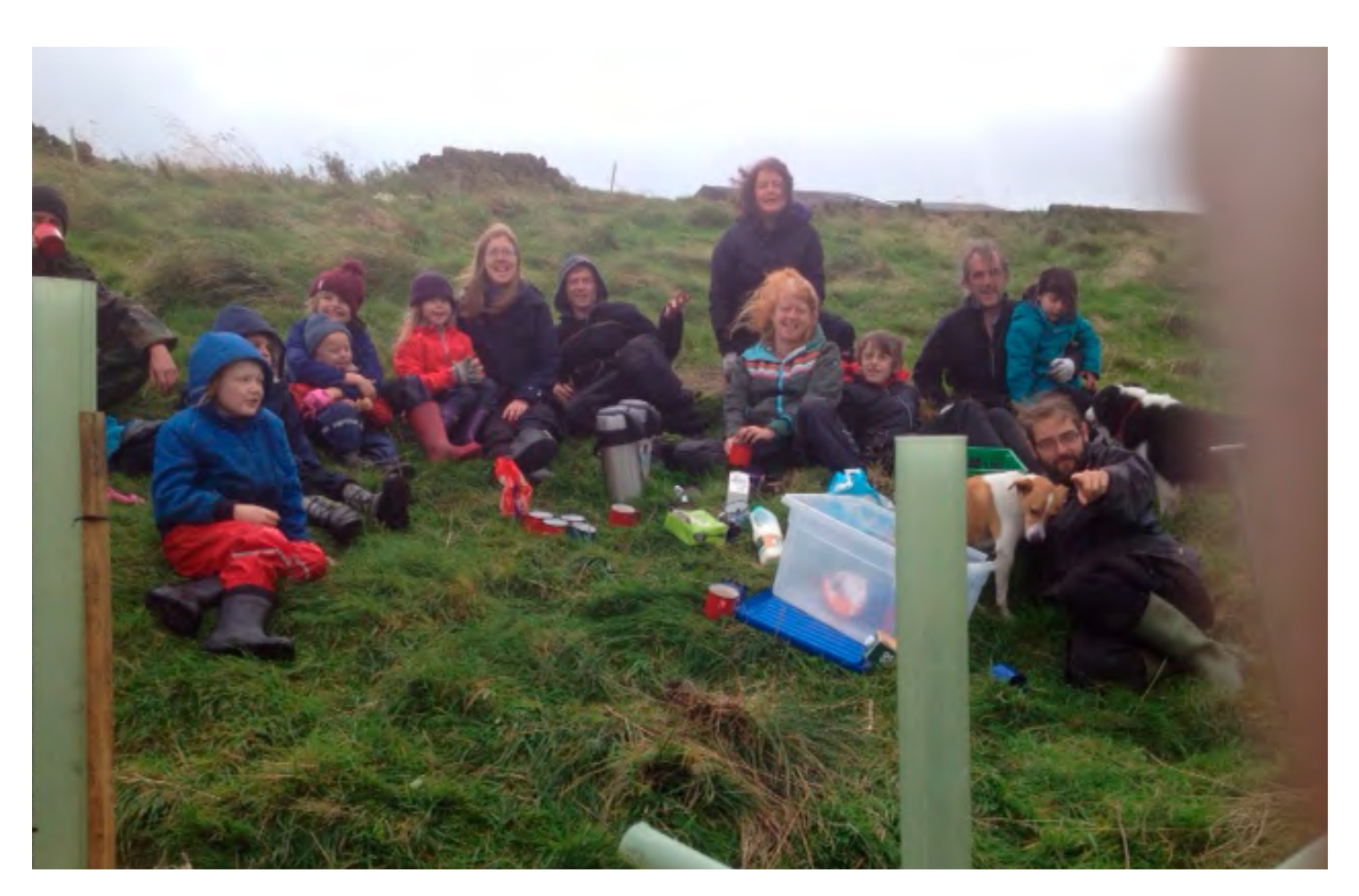
The Woodies have lunch