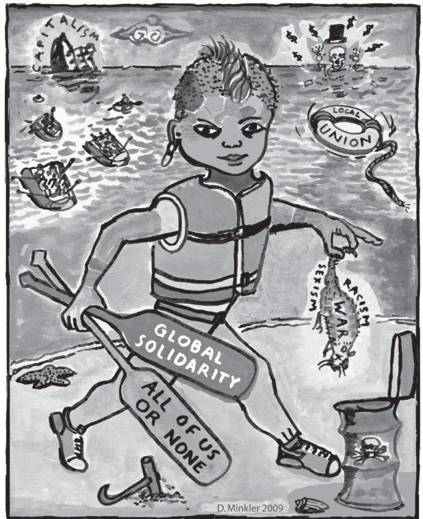
The West Coast Maritime Strike and San Francisco General Strike helped cement the power of working people and organized labor on the West Coast. The conditions that led to this great strike are with us again today—mass unemployment, attacks on workers and flagrant union-busting. Only we, the working class, can solve these problems as the strikers did in the 1930's.