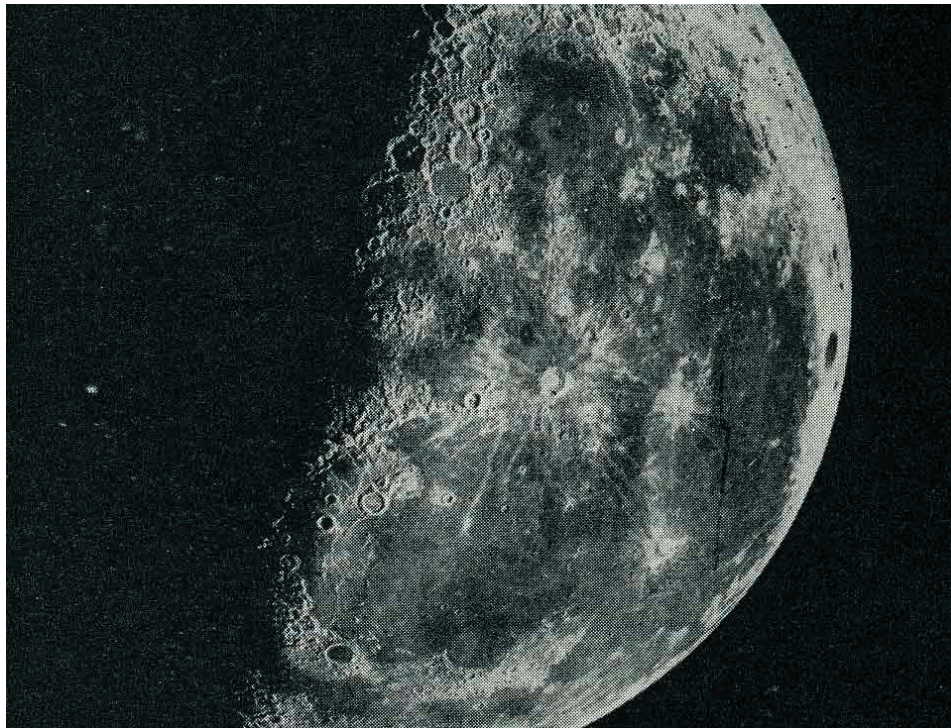
THE MOON LOOKS A LOT LIKE TEXAS but scientists hope to find some really interesting distinctions by blowing it up.

Critics argued that crashing into the moon with 5,000 pounds of dead weight at 5,600 miles per hour was, well, kind of rude.