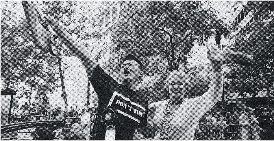
LT. DAN CHOI and actress Cloris Leachman just can't seem to grasp that keeping qualified Arabic translators out of the military will keep us all much safer.