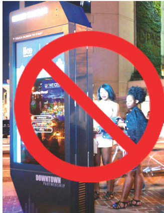
THE ENORMOUS ELECTRONIC SIDEWALK BILLBOARDS coming your way have opposition from every neighborhood on record.

Next Issue: Struggling with pronouns with celebrities!