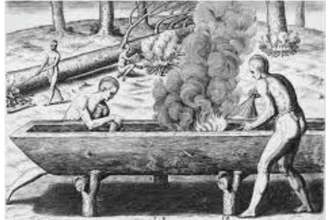
INNOVATORS AT THIS STARTUP have discovered a fuel-free alternative to the problem-plagued new Bay Bridge.

got to me," admitted one commuter sheepishly. "It's hard to trust engineers who would cave in to such a wildly stupid design."