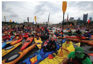
COMMUTERS concerned about safety issues have been a boon to kayak rentals.