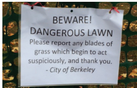
THE CITY OF BERKELEY is trying its best to protect vulnerable citizens from a lawn known to publicly attack small children.