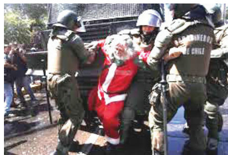
THE WAR ON CHRISTMAS was especially brutal at malls across the nation where colorful attire made Santas an easy target.