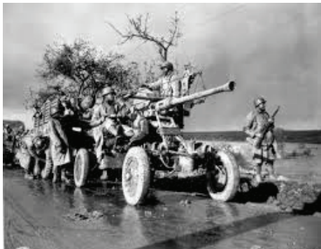
A CAPTURED CHRISTMAS TREE plays dead while enemy soldiers try to kidnap the conifer across enemy lines.

over the years when we connected it to fossil fuels and global warming we honestly thought people would care," stated one shaken war refugee.