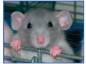
THIS CUTE LITTLE RAT was found hoarding automatic weapons and filling notebooks with ominous drawings and suspicious stories.

linked to genetically modified food, that was nothing compared to how depressed people are going to be when the big labels of what's in our food get stuck all over their cornflakes, let alone how depressed they'll be after having to