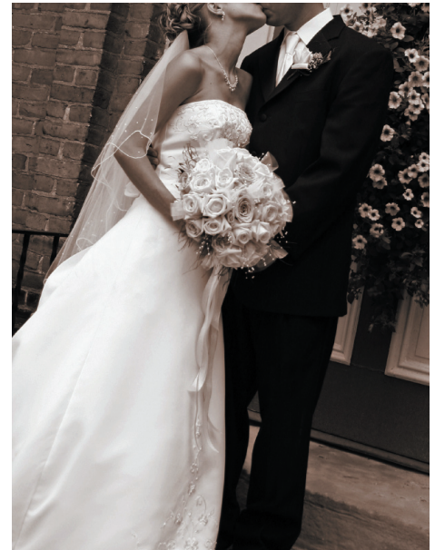
JESUS'S WIFE prefers couture and settled on lotus blossoms with roses and the traditional meal of loaves and fishes.