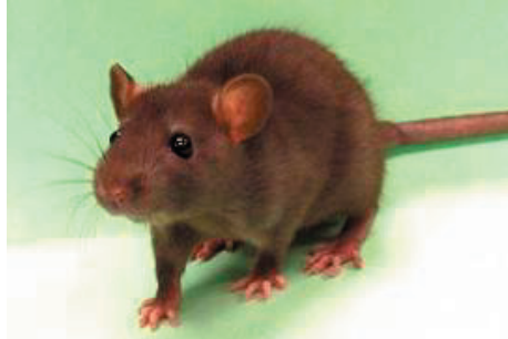
THIS DEPRESSED RAT just hangs around the lab watching soap operas.

"Most rats just think about sex and food," he acknowledged. "They like baseball but they don't really follow the game. They end up snacking under the seats."