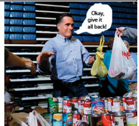
So he addressed the matter right away.