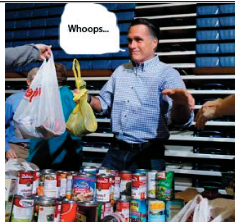
He just didn't realize that cash is much more useful.