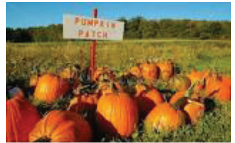
THESE PUMPKINS INSIST that they were not doing anything wrong but look how suspicious.

"We were just playing bridge," scoffed one pumpkin. "It's boring out there."