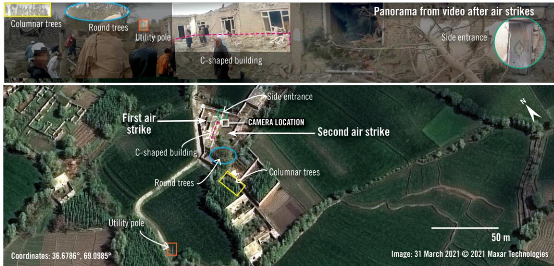
A panorama of a video acquired by Amnesty International shows damage from two air strikes on a compound in Kunduz Province, Afghanistan. The panorama highlights features from the video, that were aligned with the satellite imagery.

precisely geolocate the home, and satellite imagery corroborates that the compound was struck between 7 and 16 November 2020.