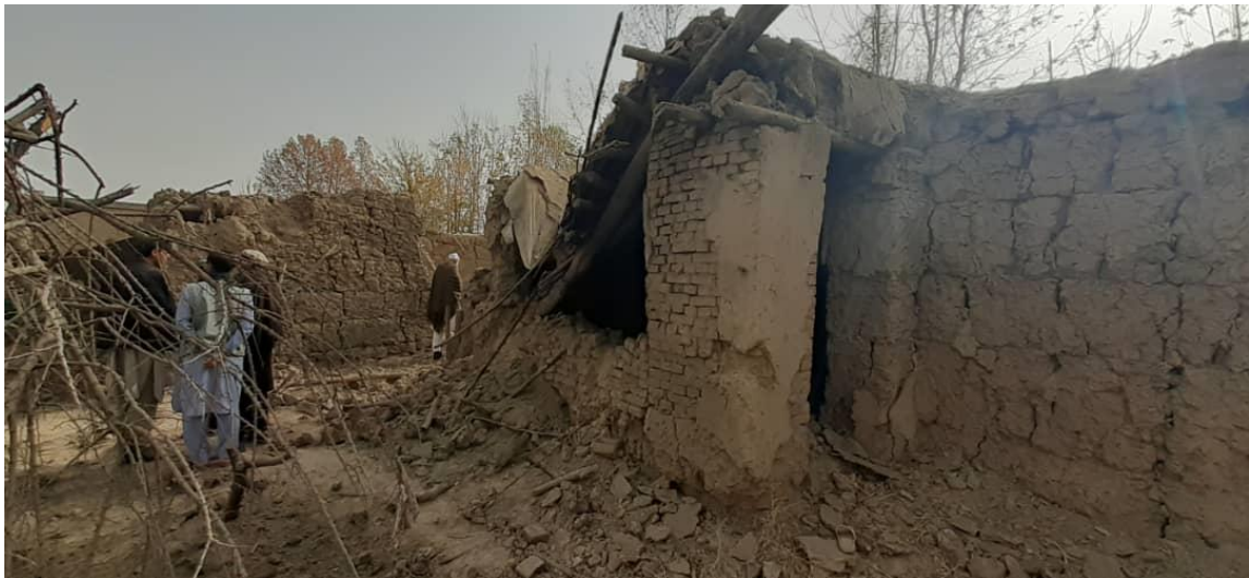
The home destroyed by the first air strike, looking southwest.

Just after midnight, a witness who was in the home heard planes begin to circle overhead. 138 About 20 minutes later, the first bomb struck the family compound. The aircraft continued to circle, and the second air strike impacted 15 minutes later.