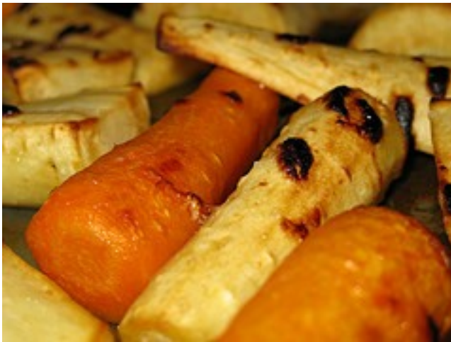
Illustration 2: