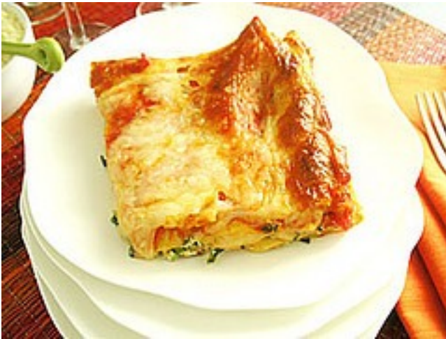
Illustration 3:

Along with basic pizzas and French bread, this is one food item I prefer to buy pre-made. When buying ingredients to make your own, it costs only fractionally less than buying a family sized fresh or frozen lasagne from the supermarket. Combined with the time and effort it takes to make... You do the maths!