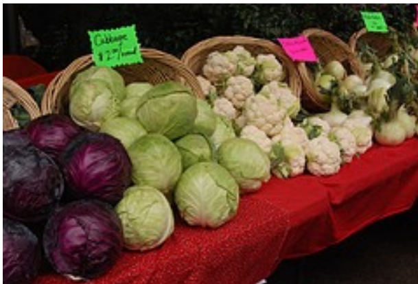
Illustration 1:

Broccoli and cauliflower: These are best steamed to preserve the flavour and texture, or can be eaten raw with dips or in salads. Try cauliflower cheese (also excellent with broccoli) or tempura cauliflower (see recipe below)