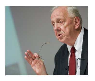
Senior Research Fellow Centre for Contemporary Aristotelian Studies in Ethics and Politics London Metropolitan University