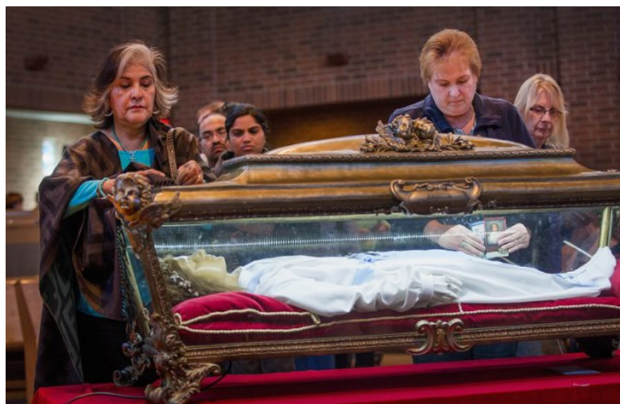
Pilgrimage of Mercy’s “Little Saint of Great Mercy”

Saint Maria Goretti (and Alessandro, if you’re up there!) please pray for your Church! ■