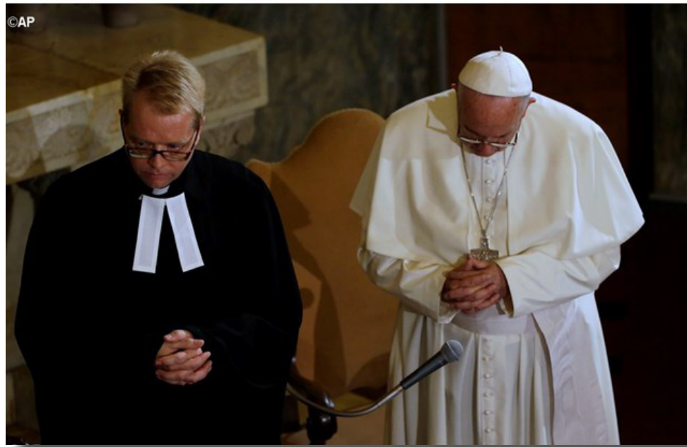
Catholics and Lutherans must ask each other for forgiveness for the scandal of past divisions--so said Pope Francis when he visited Rome's Evangelical Lutheran Church this month for an evening prayer service.