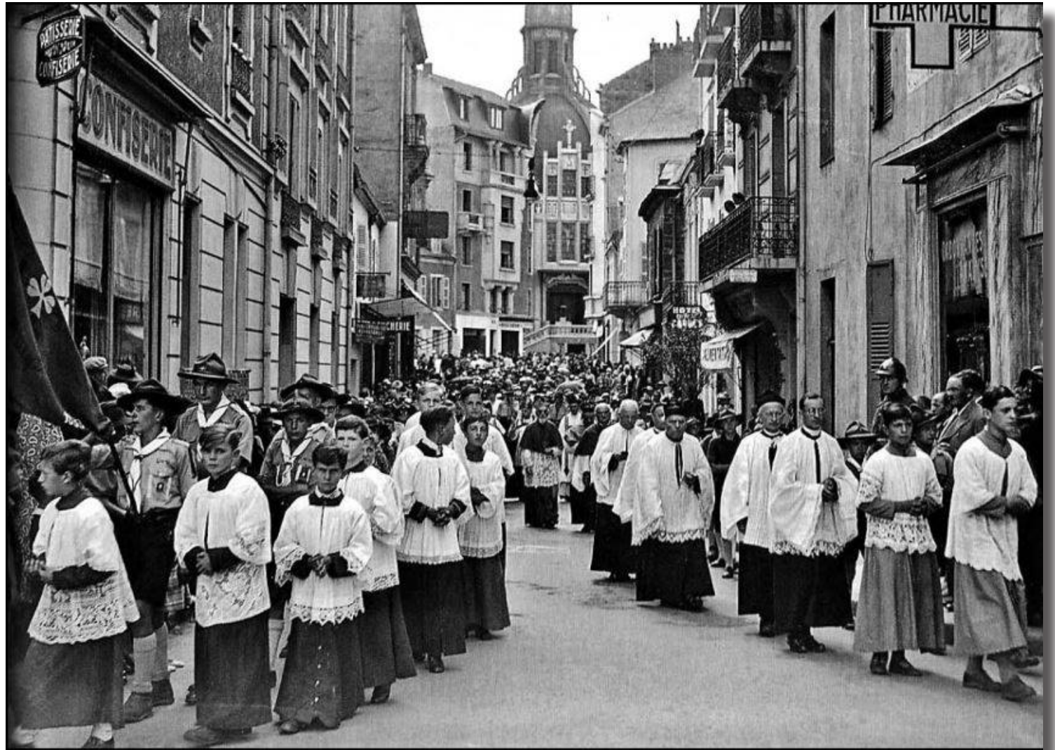
Never forget...what they have destroyed.

on the “phenomenon” that, in the past, Catholics didn't seem to need psychotherapy. It might have something to do with confession, he said, stroking his chin. It was a puzzle.