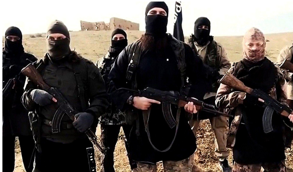
The New Sea People?

The experts have said that the cities and towns of the Mycenaean civilization,