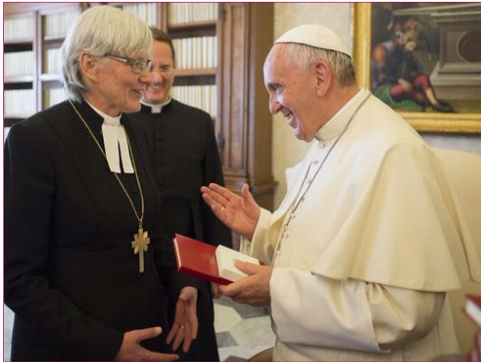
Francis receives lady “Archbishop,” head of insane Lutheran “Church” of Sweden, calling her “esteemed sister”

Francis declined to tell the woman simply what the Church has always taught and still teaches: that non-Catholics cannot partake of the Holy Eucharist because they are not members of the Catholic Church, do not profess the Catholic faith, positively reject Catholic dogmas,