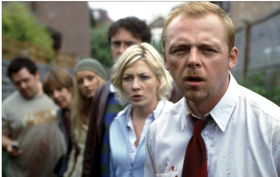
Shaun of the Dead

secular leaders. We hear the same drivel from our Church leaders. And again, this is just the latest in a continuing pattern. For the last 50 years, we have abandoned our actual values for the false values of tolerance and acceptance, thinking that if we are just nicer to people, they will become more like us, even as we become less like us day by