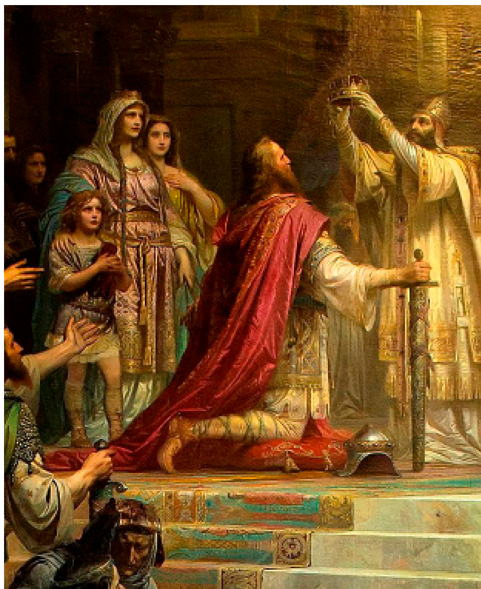
Coronation of Charlemagne on Christmas, 800 A.D.

The first of these moments is the baptism of Clovis, which took place, according to tradition, on December 25, 496.