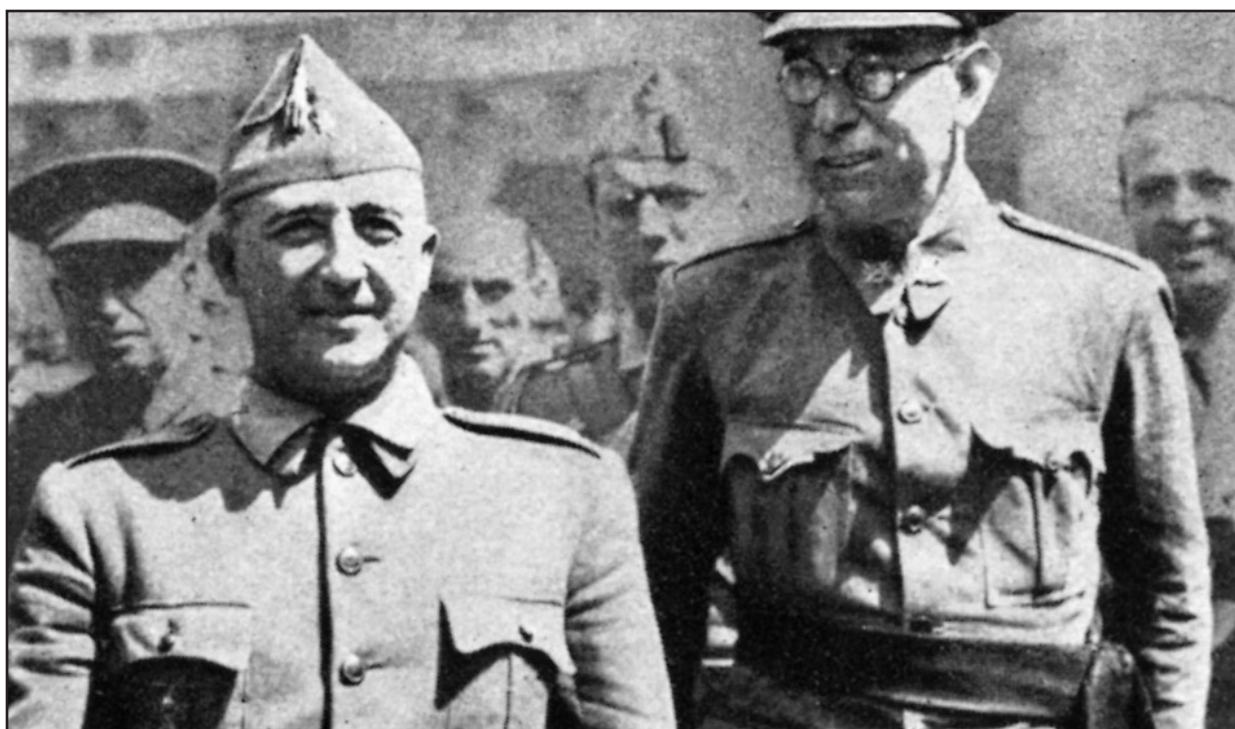
Generals Francisco Franco (left) and Emilio Mola (right)