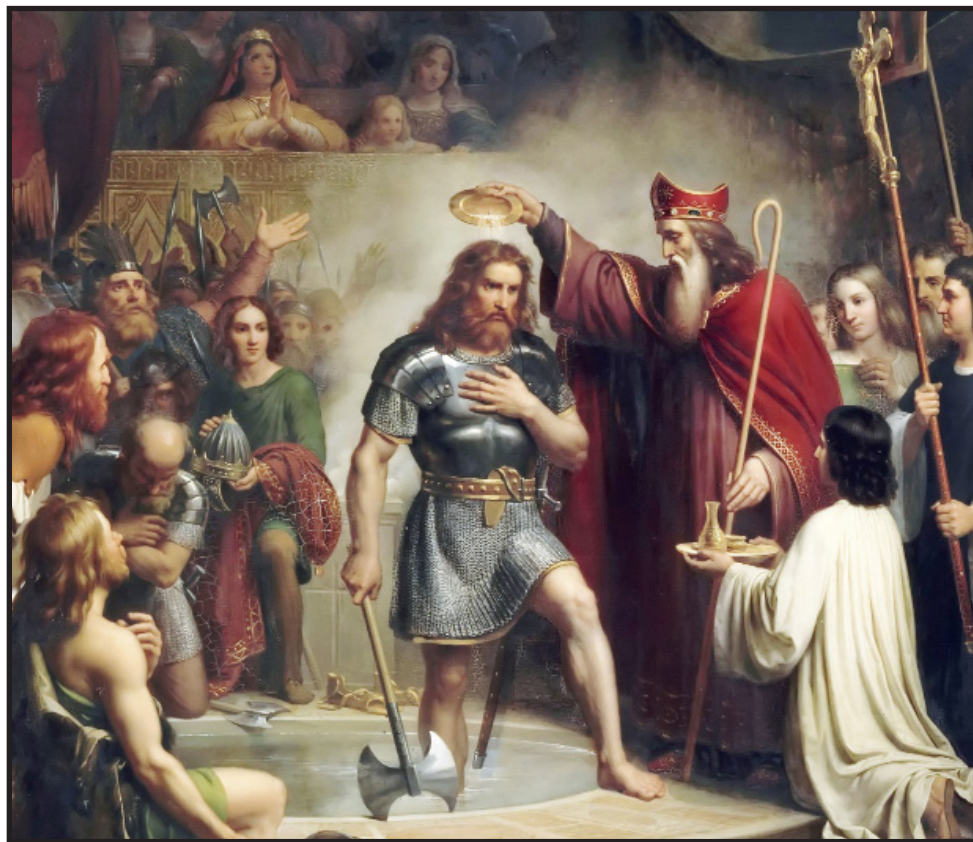
François-Louis Dejuinne (1786–1844), The Baptism of Clovis