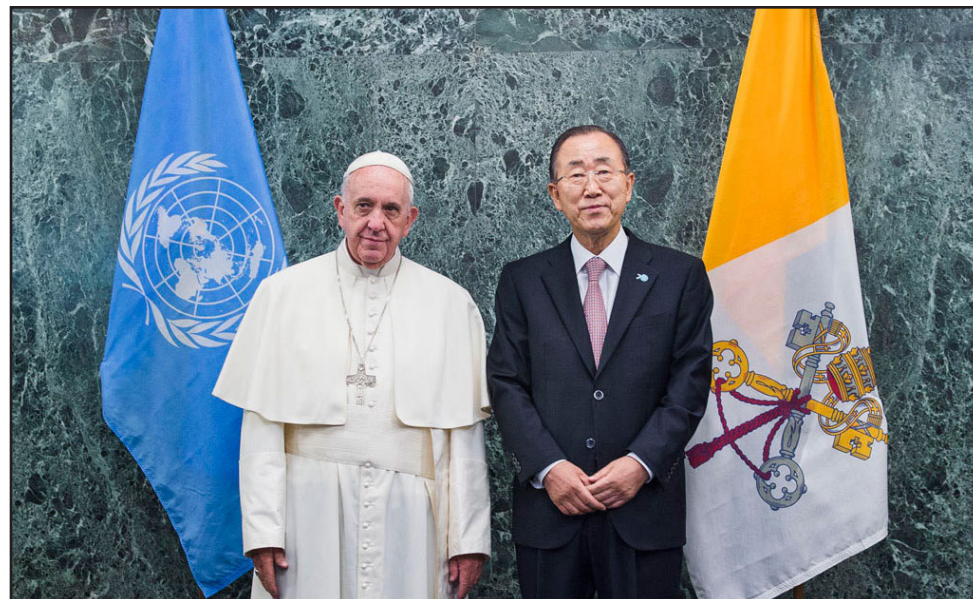
Pope Francis and former UN Secretary-General, Ban Ki-moon, at UN’s HQ

It proudly sports a cosmopolitan identity and talks about diversity and inclusion. It firmly opposes leaders like Salvini and U.S. President Donald Trump, whose ideology is one “that always ends badly—it leads to war,” as